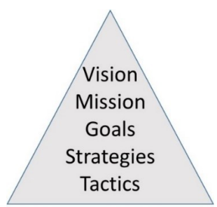
Figure 2 . Pyramid of concepts for higher quality of organisation (Taylor, 2020)

higher quality and support is provided for an organisation.