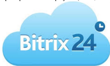
Figure 7. Logo of the Bitrix24 strategic tool

Bitrix 24 (Figure 7) is a freely available tool for Strategic Planning, business intelligence and a project management platform. Tasks can be assigned to company employees through the tool. The chart can review the tasks and their status, the responsible person and the chronological relationship. This gives the user a complete picture of the projects (Bitrix, 2020).