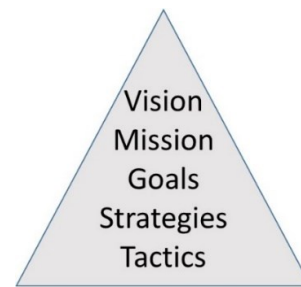
Figure 2. Pyramid of concepts for higher quality of organisation (Taylor, 2020)

higher quality and support is provided for an organisation.